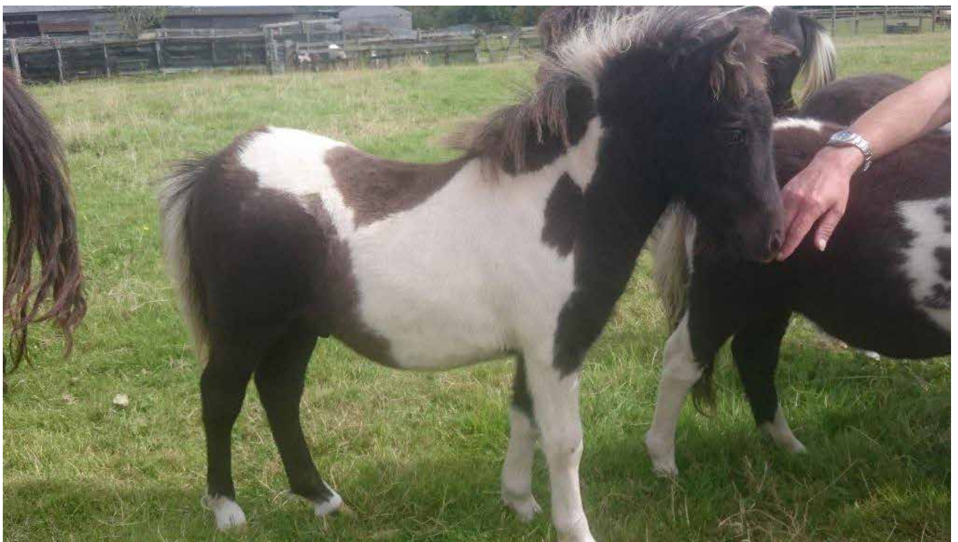
Lot 17 - Blenheim Xander