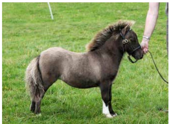
Lot 28 - Cadno Midnight Pixie