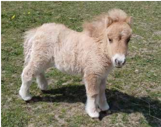
Lot 2 - Cadno Wood Elf