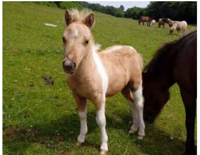
Lot 30 - Cadno Nuggle