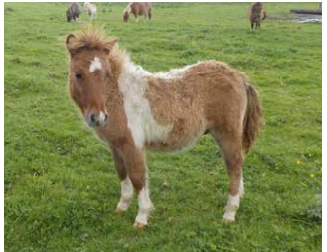
Lot 3 - Cadno Coblyn