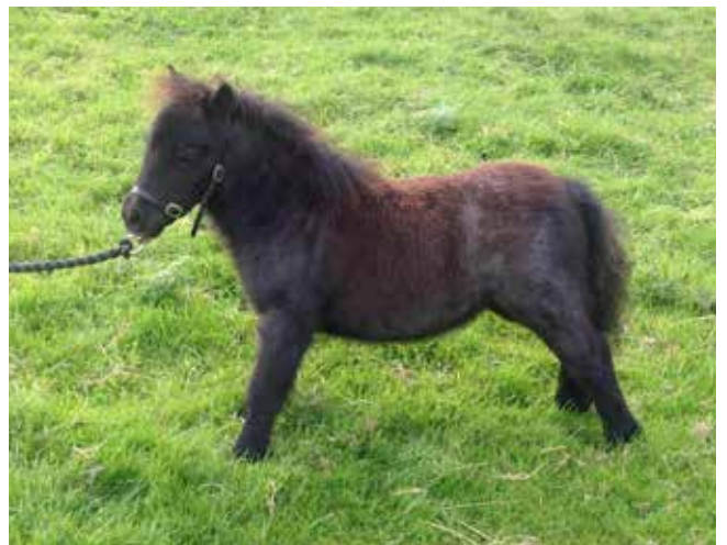
Lot 76 - Mardlebrook Whisper