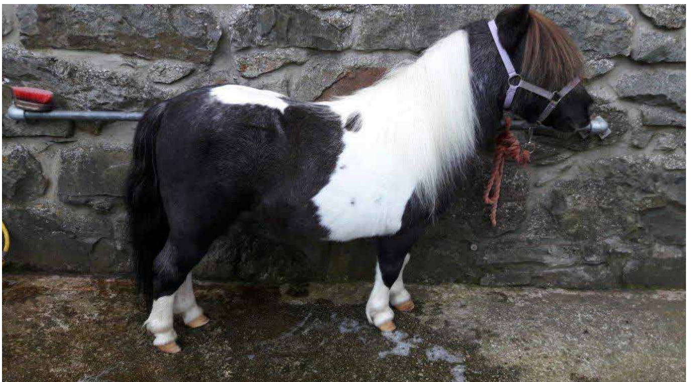
Lot 81 - Valentine Cherakee