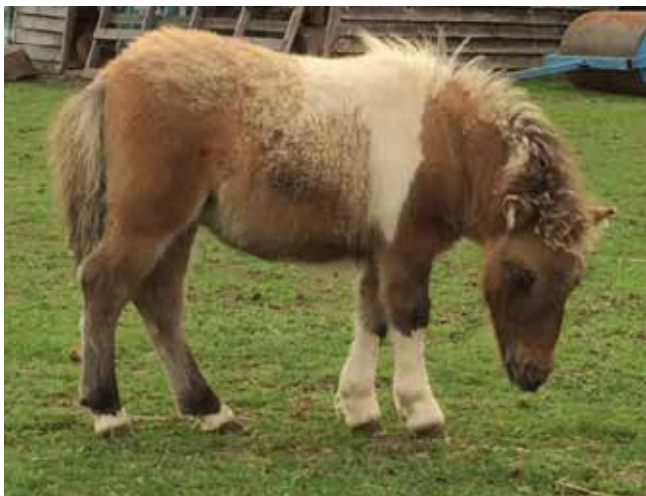
Lot 75 - Khabaqui Venus