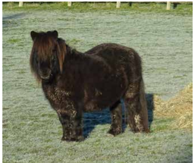
Lot 132 – Stow Vanessa