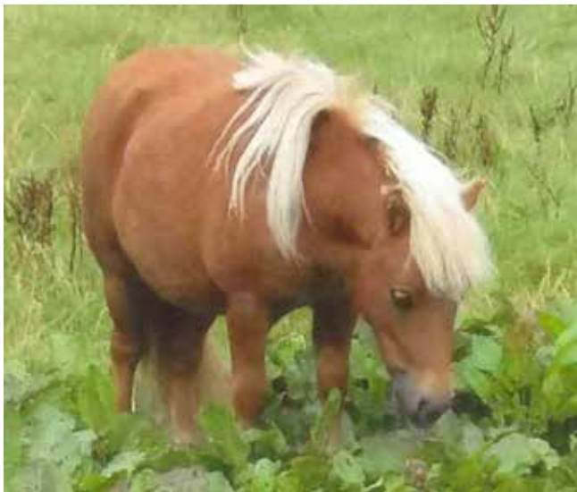
Lot 111 – Trujim Renesmee