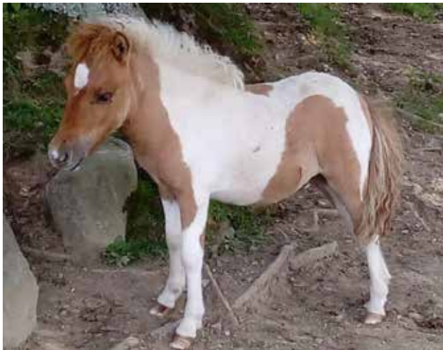
Lot 29 - Cadno Celtic Sprite