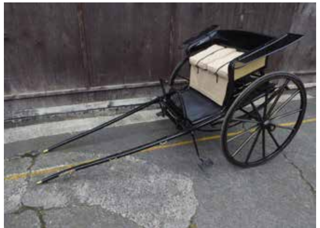
Lot 201 – Defender Pony Vehicle