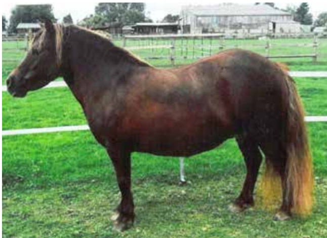
Lot 137 – Sharptor Etienne