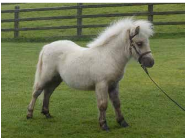
Lot 27 - Cadno Phoenix